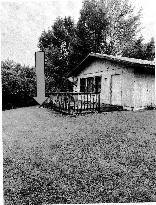
Cabin & Existing tank below Red arrow

EXPERT SERVICE. LASTING VALUE. CLEAN WATER