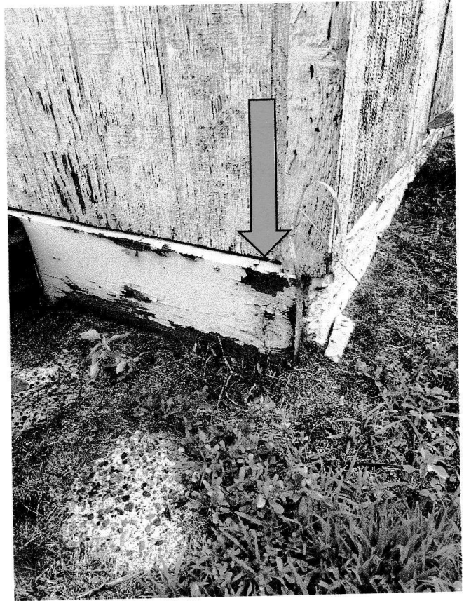
Benchmark = 100.00 Top of the board