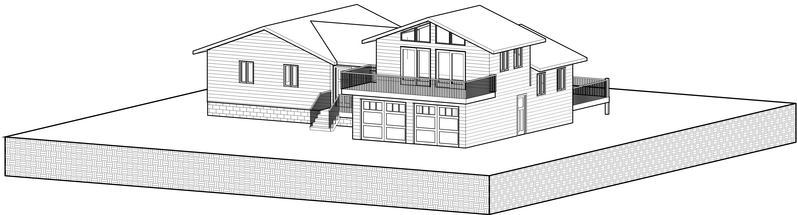
3 FRONT 3D VIEW