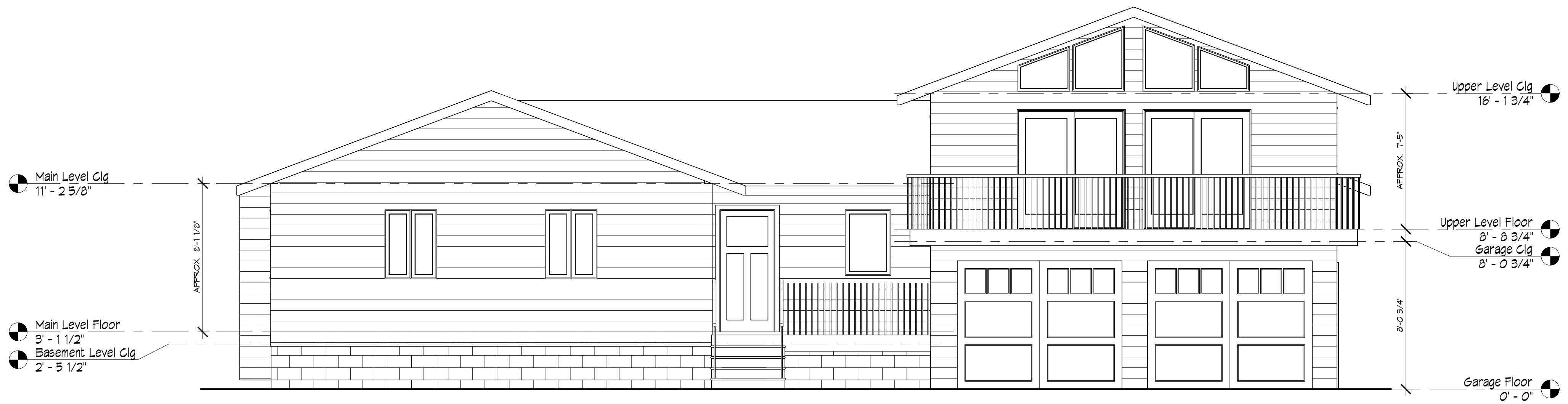
1 FRONT ELEVATION 1/4" = 1'-0"

PRELIMINARY NOT FOR CONSTRUCTION (FOR BIDDING PURPOSES ONLY)