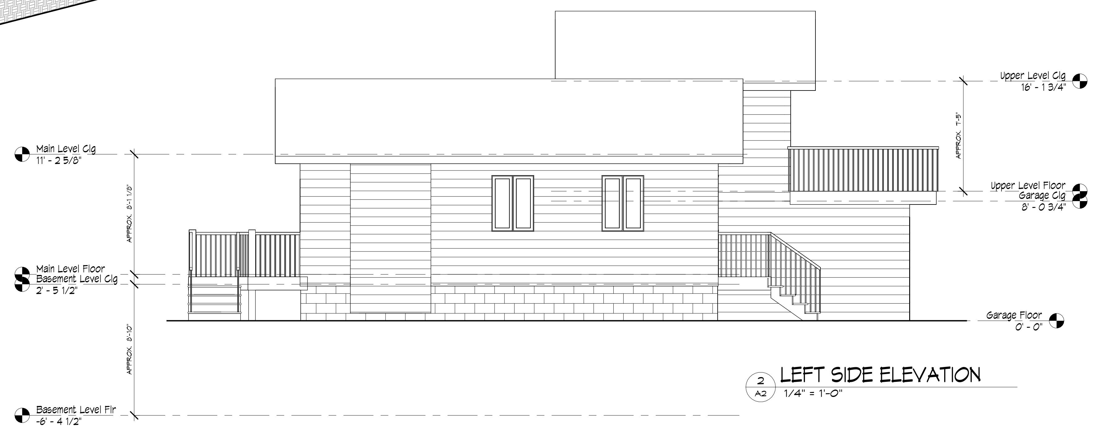
2 LEFT SIDE ELEVATION 1/4" = 1'-0"

PRELIMINARY NOT FOR CONSTRUCTION (FOR BIDDING PURPOSES ONLY)