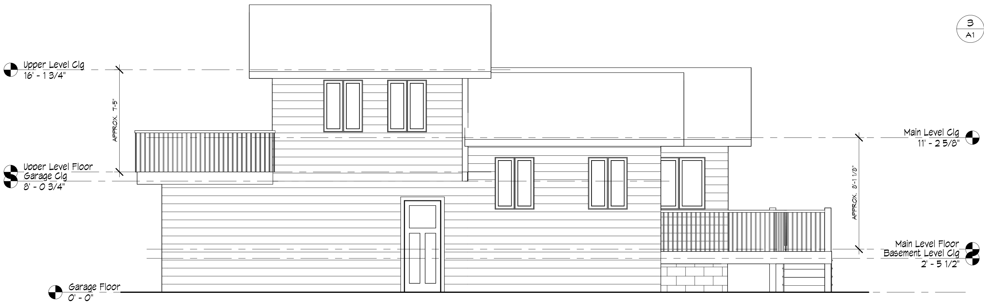
2 RIGHT SIDE ELEVATION 1/4" = 1'-0"

BEHR DESIGN, INC. DOES NOT ASSUME ANY RESPONSIBILITY FOR VARIOUS CONSTRUCTION TECHNIQUES AND/OR QUALITY OF MATERIALS USED IN THE CONSTRUCTION OF THIS PROJECT. THE CLIENT IS RESPONSIBLE FOR OBTAINING ALL NECESSARY PERMITS AND APPROVALS FROM ALL APPLICABLE AGENCIES. BEHR DESIGN, INC. IS NOT A LICENSED PROFESSIONAL ENGINEER OR ARCHITECT. THE CLIENT SHALL BE RESPONSIBLE FOR OBTAINING ALL NECESSARY PERMITS AND APPROVALS FROM ALL APPLICABLE AGENCIES. BEHR DESIGN, INC. IS NOT A LICENSED PROFESSIONAL ENGINEER OR ARCHITECT. THE CLIENT SHALL BE RESPONSIBLE FOR OBTAINING ALL NECESSARY PERMITS AND APPROVALS FROM ALL APPLICABLE AGENCIES. BEHR DESIGN, INC. IS NOT A LICENSED PROFESSIONAL ENGINEER OR ARCHITECT. THE CLIENT SHALL BE RESPONSIBLE FOR OBTAINING ALL NECESSARY PERMITS AND APPROVALS FROM ALL APPLICABLE AGENCIES.