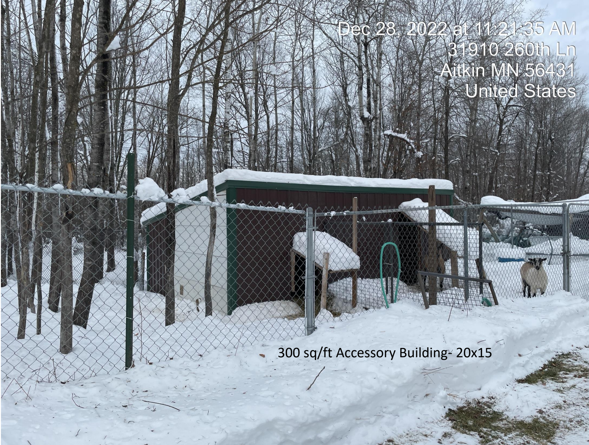
300 sq/ft Accessory Building- 20x15

Dec 28, 2022 at 11:21:35 AM 31910 260th Ln Aitkin MN 56431 United States