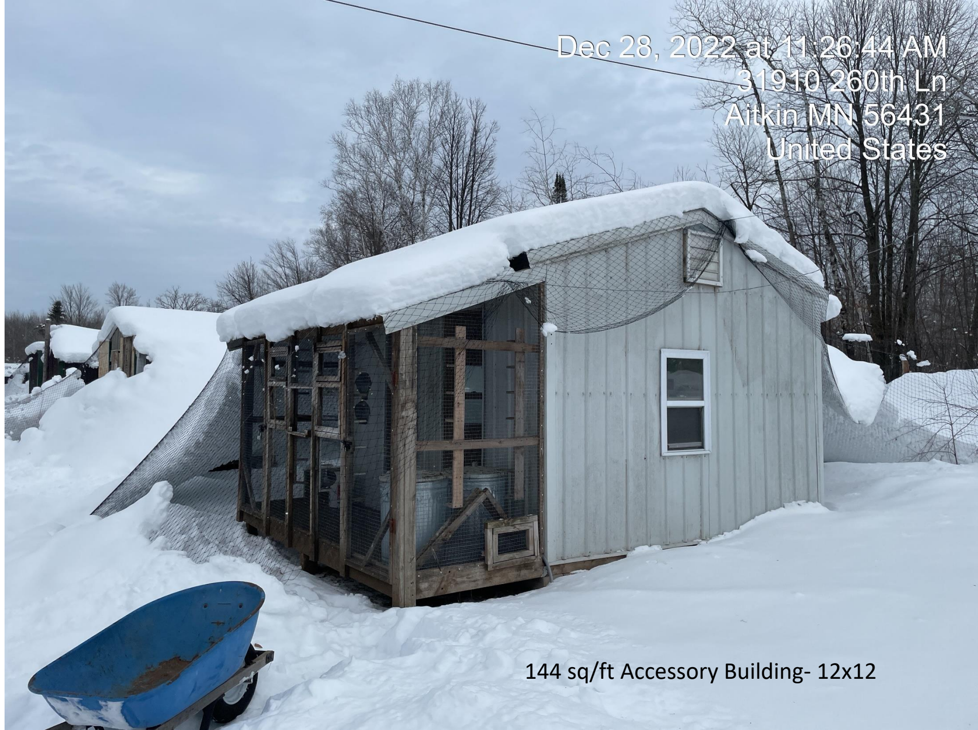
144 sq/ft Accessory Building- 12x12

Dec 28, 2022 at 11:26:44 AM 31910 260th Ln Aitkin MN 56431 United States