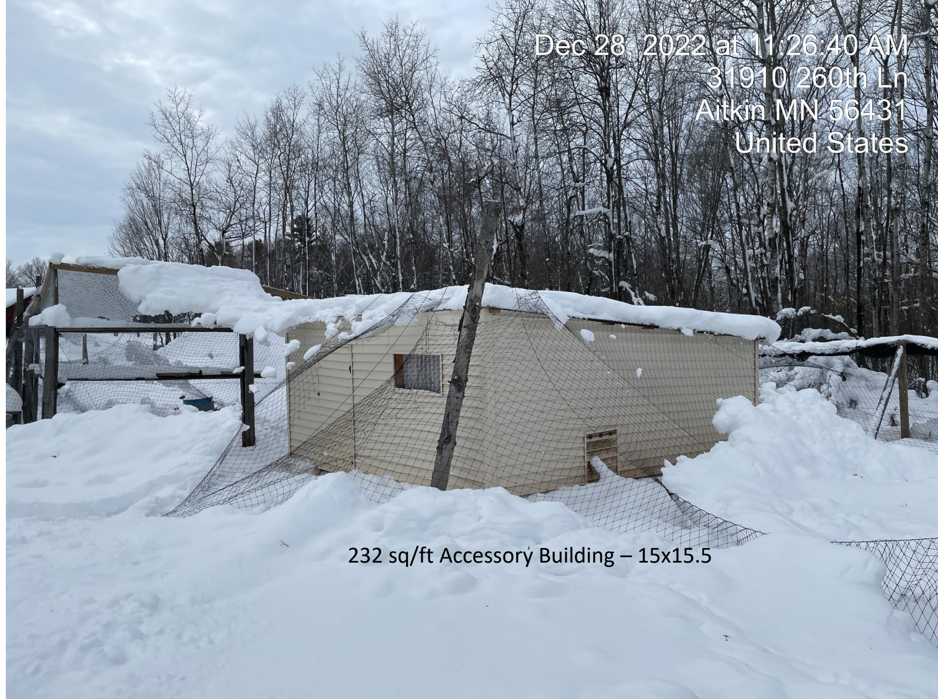
232 sq/ft Accessory Building – 15x15.5

Dec 28, 2022 at 11:26:40 AM 31910 260th Ln Aitkin MN 56431 United States