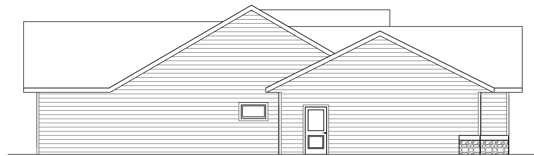
LEFT ELEVATION 1/8" = 1'