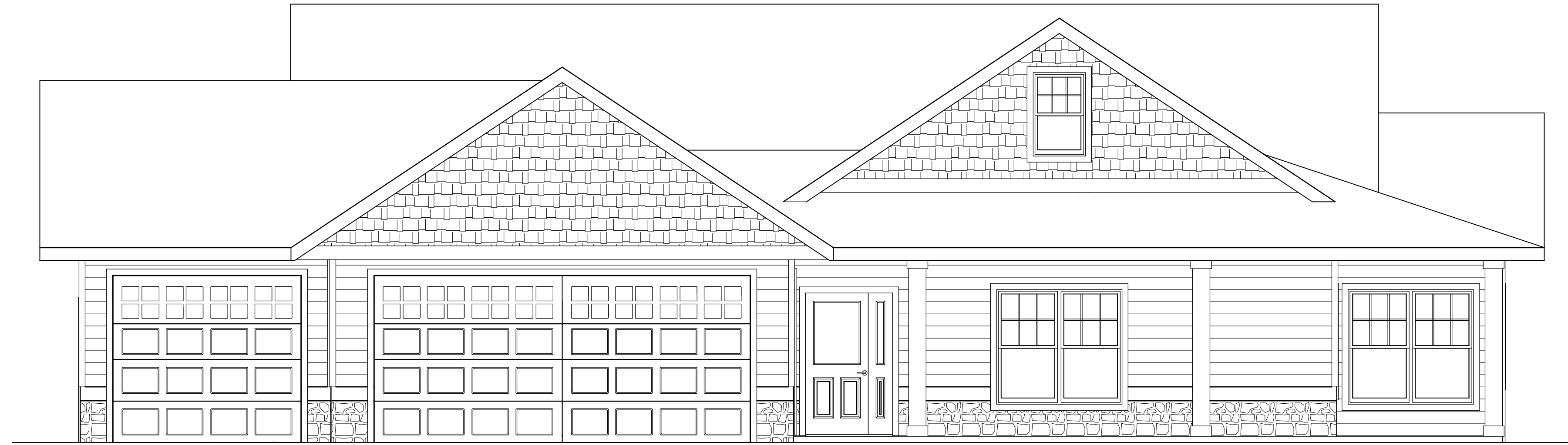
FRONT ELEVATION 1/4" = 1'

ANY INFORMATION, IDEAS, OR CONCEPTS IN THIS PLAN ARE THE PROPERTY OF B-DIRT CONSTRUCTION. THESE PLANS ARE NOT TO BE REPRODUCED IN ANY WAY, WITHOUT WRITTEN PERMISSION FROM B-DIRT CONSTRUCTION.