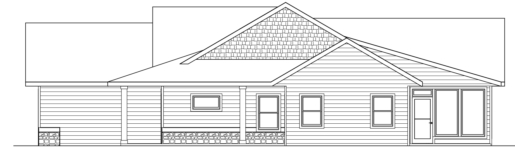
RIGHT ELEVATION 1/8" = 1'