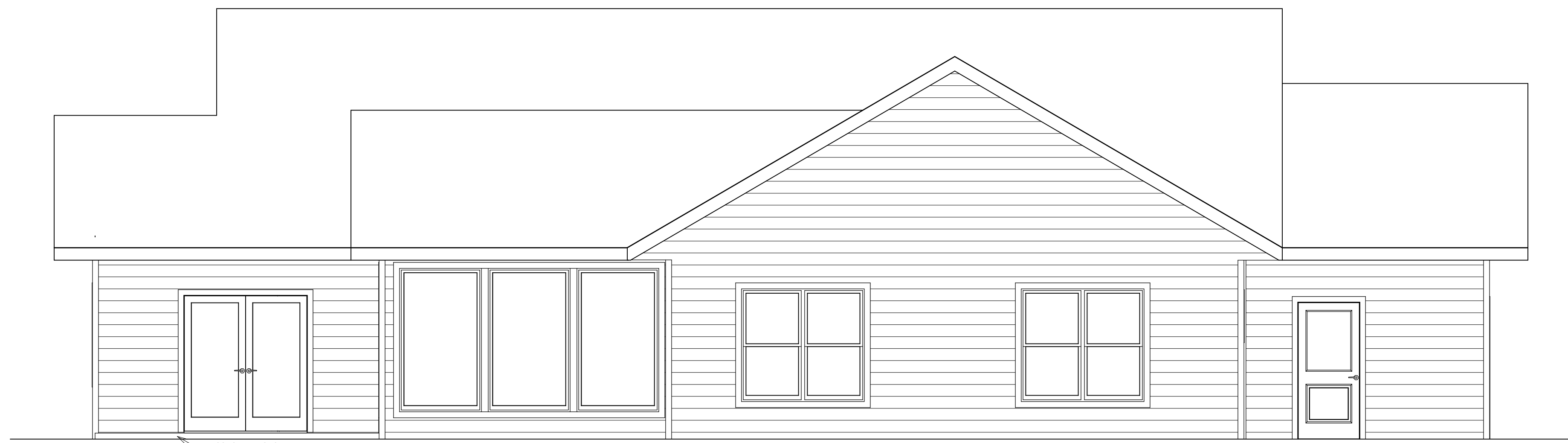
REAR ELEVATION 1/4" = 1'