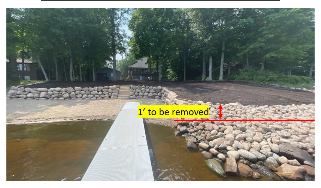
Rocks along west property line to be removed.

Rip-Rap above ordinary high water level (OHW) to be removed.