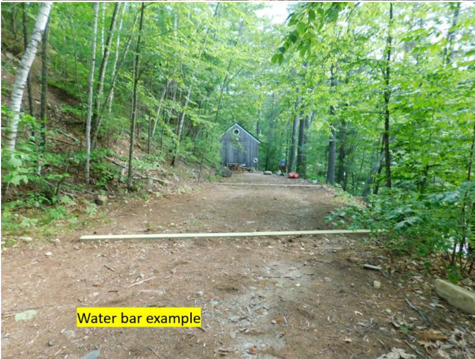
Water bar example