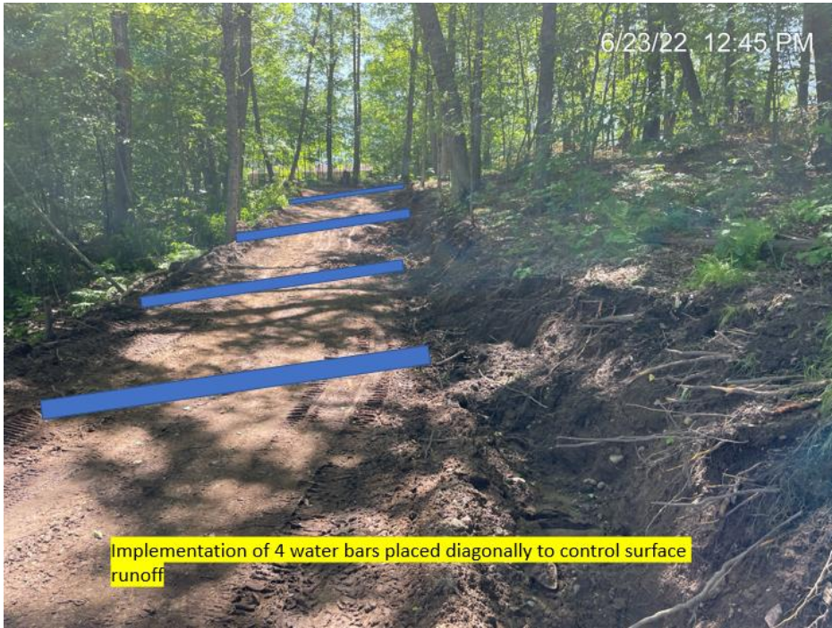
Implementation of 4 water bars placed diagonally to control surface runoff