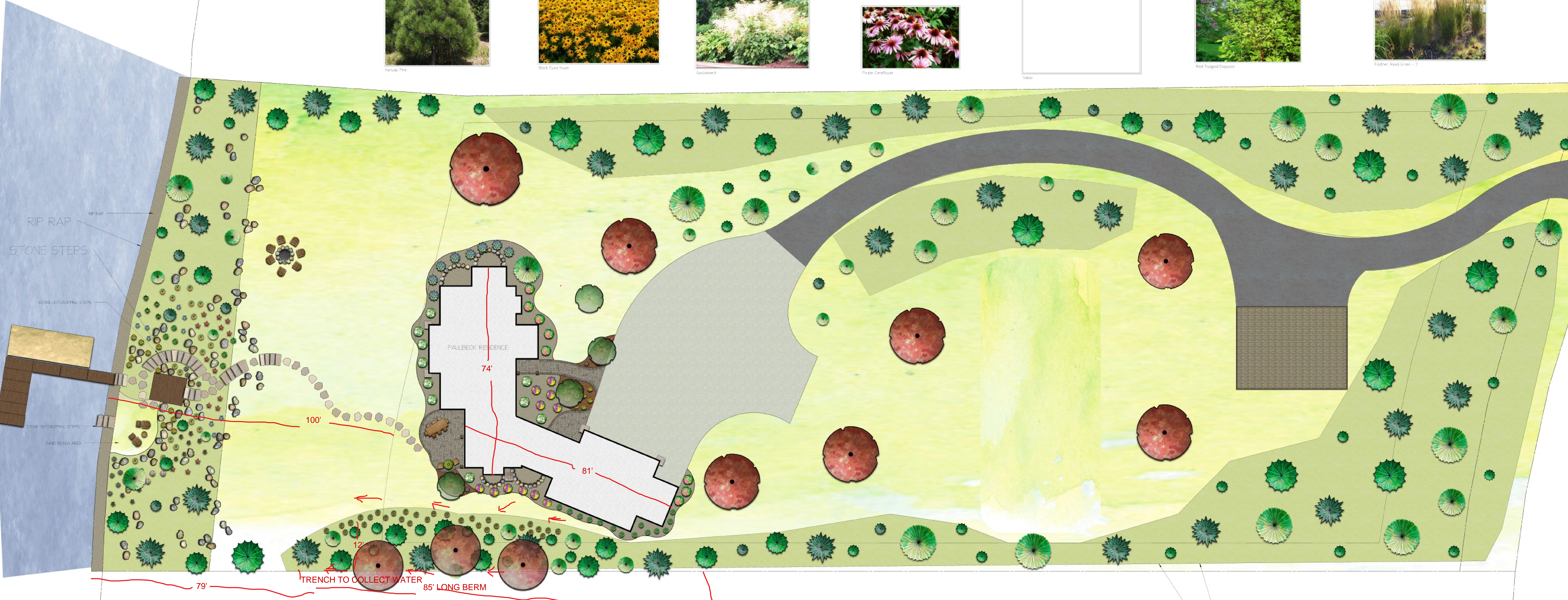
Feather Reed Grass

RIP RAP STONE STEPS STONE OUTCROPPING STEPS SAND BEACH AREA