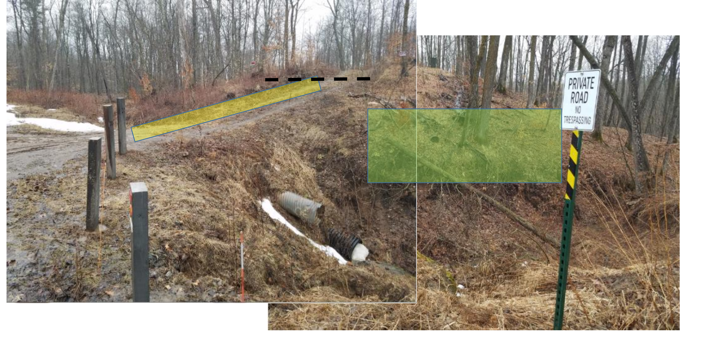
— — — — Scrape 10-15 yds off the top of the hill down to this line, fill used in washout area.

Widen the road on this side to allow safer access and keep vehicles away from drainage area.