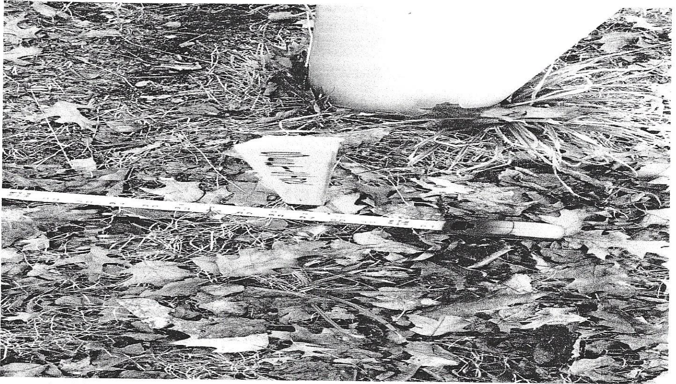
PHOTO AT TANK VENT WITH MEAS. TAPE.