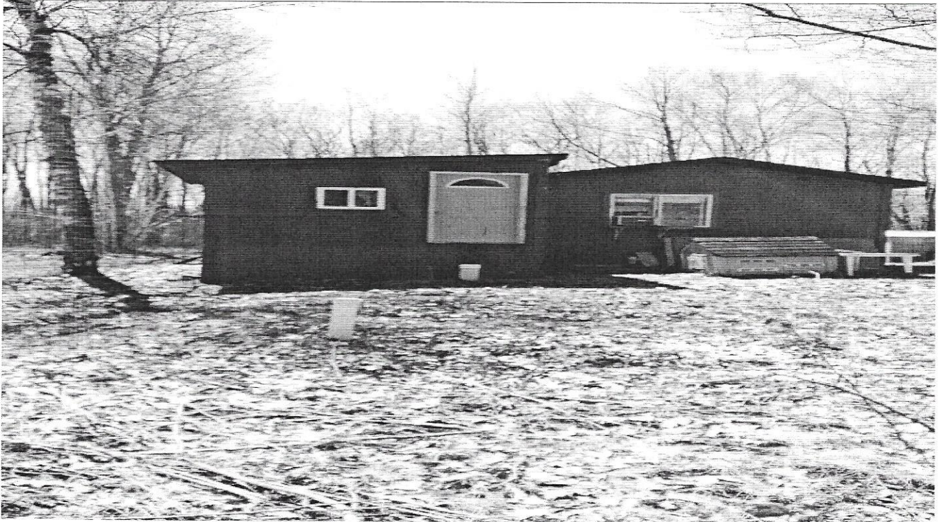
HSE. VIEW LOOKING NORTH? NEW WING, AT LEFT

From: troy.rhodes Sent: Tuesday, May 12, 2020 6:29 PM Re: troy.rhodes Subject: